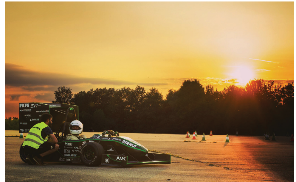
Track testing of the improved powertrain design