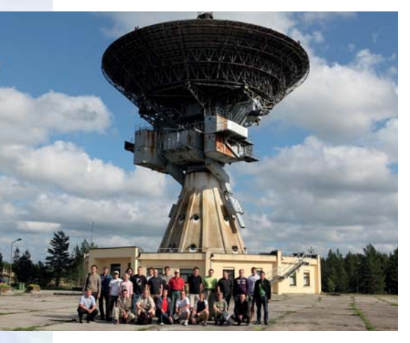
Student satellite teams at Irbene Radio Astronomy Center, Latvia

The Aalto-1 project started in the beginning of 2010, when a group of students carried out a feasibility study of a nanosatellite. Since then the project has generated significant excitement, and reformed teaching and learning in the interdisciplinary area of space technology. Additionally, the project has created an extensive collaboration network of many Finnish and international partners.