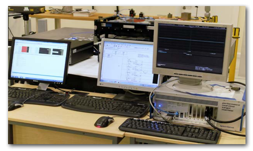
The research platform consisting of the Speedgoat target machine and development computer at the front, and the test rig at the rear

was developed to filter out the low frequency noise from the accelerometer measurements, and to double integrate the signals in order to estimate displacement.