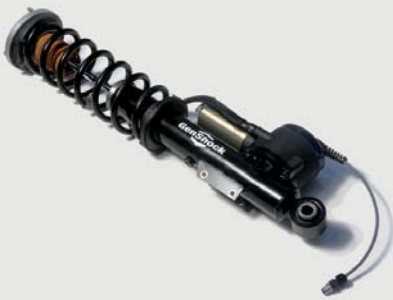
GenShock shock absorber

The real-time target machine communicates with each GenShock over a private distributed CAN network. A connection to the vehicle's main CAN bus allows the target machine to receive information such as steering position, accelerator, braking, and GPS.