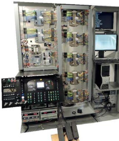
The new hardware-in-the-loop test bench

The project was a great success with Proterra praising the seamless integration of Speedgoat and MathWorks tools.